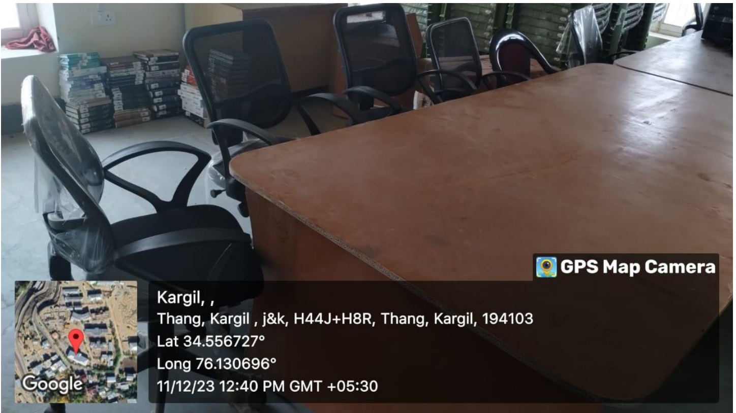
Books in College Library

Kargil, , Thang, Kargil , j&k, H44J+H8R, Thang, Kargil, 194103 Lat 34.556727° Long 76.130696° 11/12/23 12:40 PM GMT +05:30